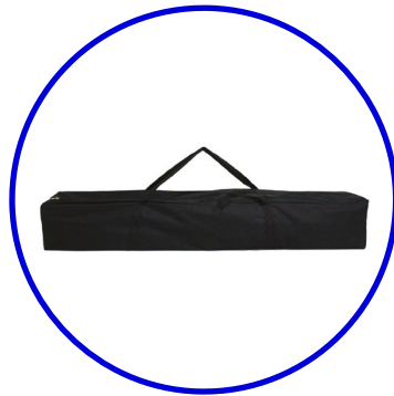
QTY 1: Black Nylon Carry Bag