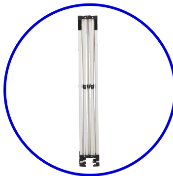
QTY 1: Frame w/ Pre-Installed Graphic

• 7 3/4" L x 7 3/4" W x 61 5/8" H (Collapse Frame)